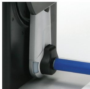
Colored LED indicator provides rewriter operation status