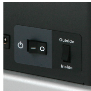
Rewinding direction switch to rewind "inside or outside" label rolls